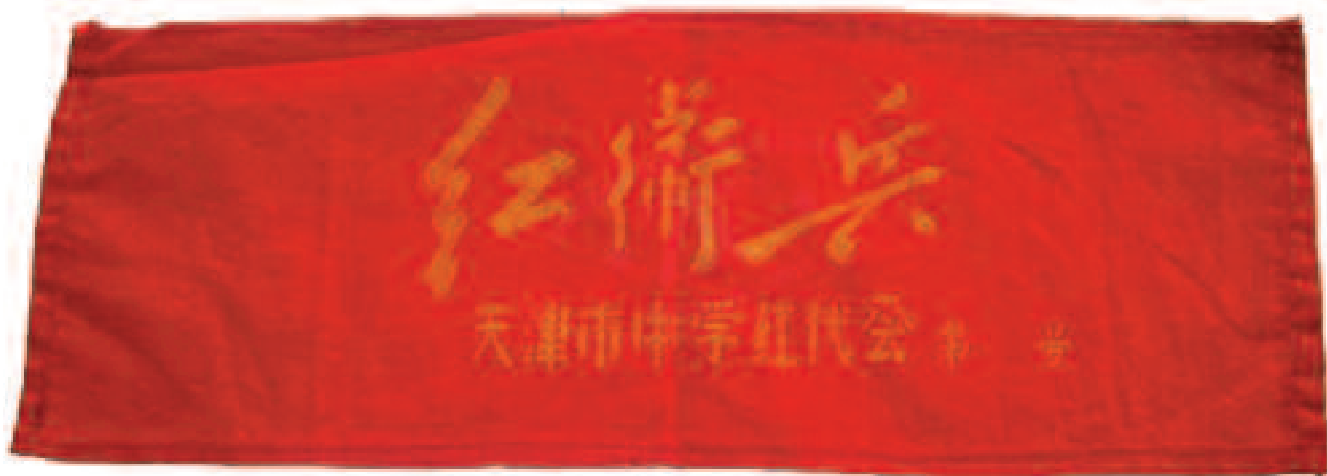
ZFC2020 A Red Guard armband from the City of Tianjin Secondary Schools. Acquired in Beijing in the 1990s.

Armbands of the Chinese Cultural Revolution More commonplace than red flags were the red armbands. If every group had a red flag every member had a red armband