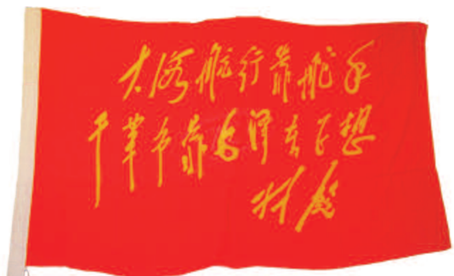
ZFC2480 China - Red Guard Flag - Lin Biao Slogan. This Flag to Mao by Lin Bao was a favorite slogan of the Cultural Revolution, "Sailing the seas, we rely on the helmsman. Making the revolution we rely on Mao Zedong."