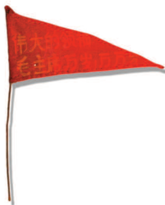
ZFC1268 "Long Live Chairman Mao, the Great Leader" Flag. This small red pennant from the Cultural Revolution translates, "Long live the great leader Chairman Mao." Acquired in Hong Kong in 1998.