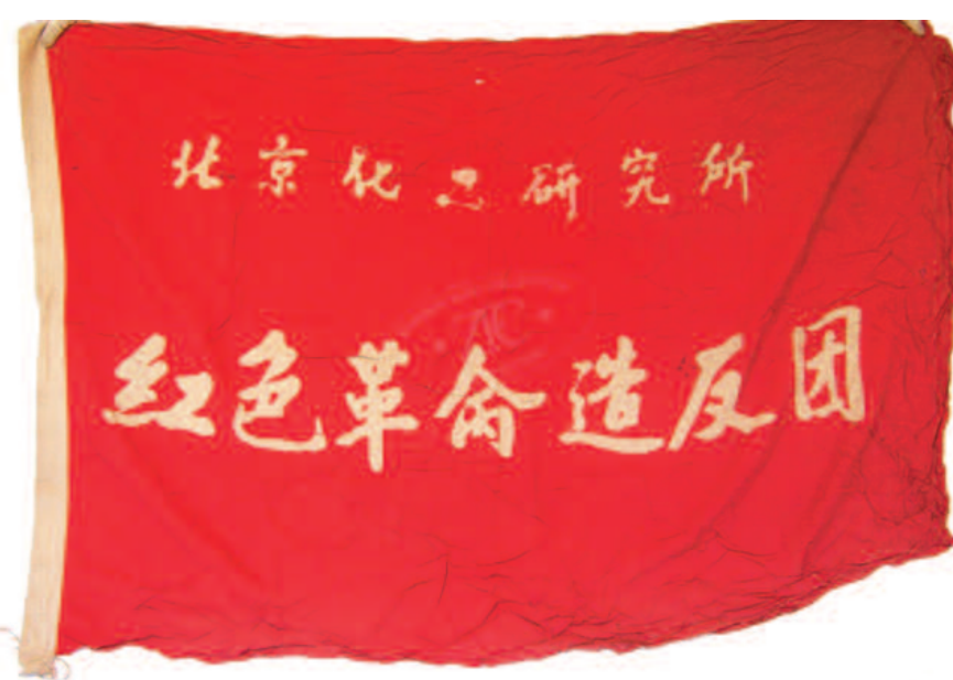
ZFC2479 This Cultural Revolution flag is from the Red Revolutionary Rebel Group of the Beijing Chemical Industry Research Institute. This flag was acquired in Beijing in 2007.