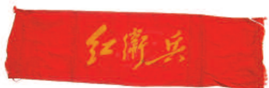
ZFC2025 This armband simply states Red Guard. Acquired in Beijing in the 1990s.