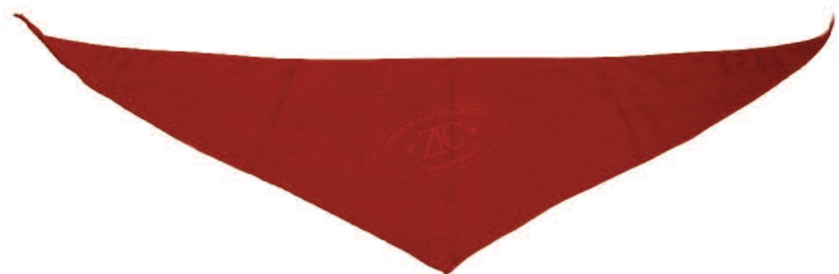
ZFC1264 China - Young Pioneers Red Scarf. The red scarf of a Young Pioneer is their only uniform item. Sometimes simply called the "Red Scarves", the Young Pioneers are ubiquitous throughout China. The red variously symbolizes the victorious revolution and the blood sacrificed by the martyrs. This example dates from the 1980s.