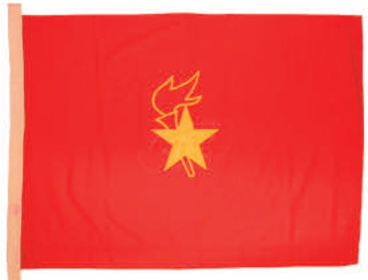
ZFC1265 Detachment of the Young Pioneers of China Flag. This is a large detachment flag of the Communist Chinese youth organization, the Young Pioneers of China, which is operated by the Communist Youth League, the organization of older youth that comes under the direct supervision of the Chinese Communist Party. The flag's red background symbolizes victory, the star represents the Communist Party of China and the torch the brightness of the communist path. This flag dates from the 1980s.