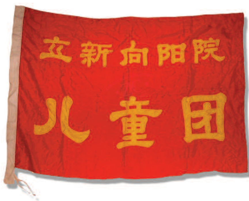
ZFC1244 PS China - The Lixin Children's Group. This is the flag of the "Facing the Sun" Court-yard Children's Group of Lixin, China. "Facing the Sun" was a Cultural Revolution metaphor for Mao Zedong. This flag was acquired in Beijing in the 1990s.