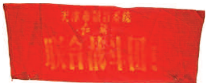
ZFC2023 An armband from the Red Flag United Combat Team from the Banking System of the City of Tianjin. Acquired in the 1990s.