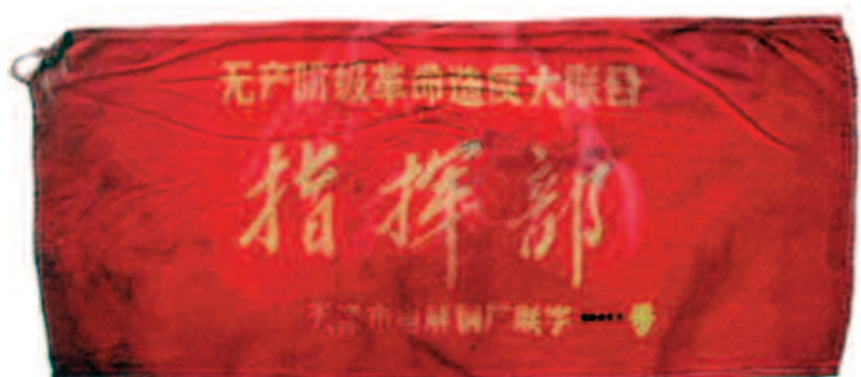
ZFC3016 An armband from the Proletarian Revolutionary Rebels Great Unified Command Center of the Copper Electrolysis Plant of the City of Tianjin. Acquired in 2004.