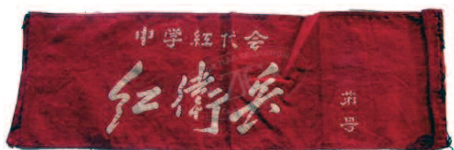
ZFC2021 A generic Red Guard meeting representative armband. Acquired in Beijing in the 1990s.