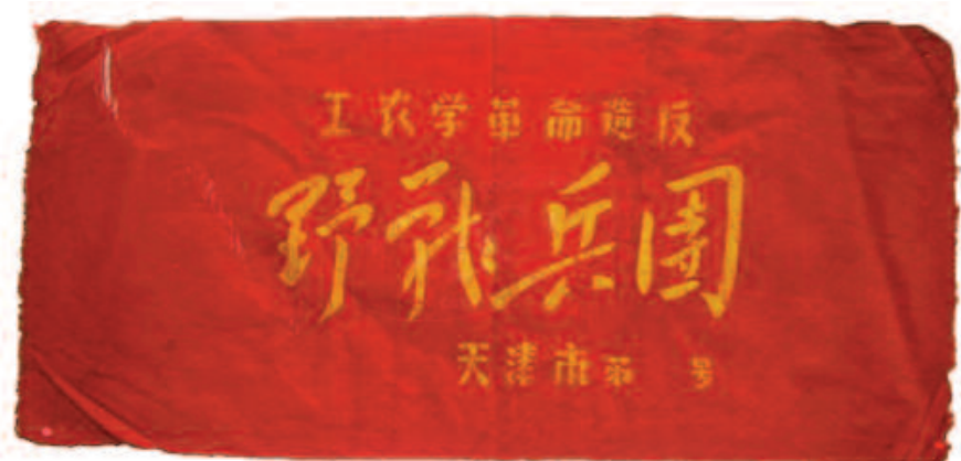
ZFC2019 An armband from the Worker-Peasant-Student Revolutionary Rebel Field Operation Corps of the City of Tianjin. Acquired in Beijing in the 1990s.