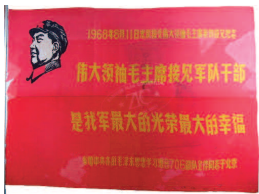
ZFC0753 PR China Unit 8706 Commemorative Color. This Commemorative Military Color was presented to Unit 8706 for their audience with Mao Zedong and completion of Mao Zedong Thought Study, in 1968. This flag was acquired in 2004.