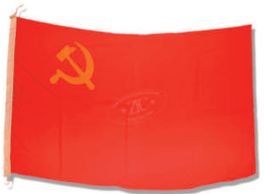
ZFC1267 The flag of the Communist Party of China, which dates from the 1930s and was formally adopted in 1942; is the symbol of the founding and ruling party of China, its red background has become the basis for almost all Chinese flags. This flag dates from 1976.