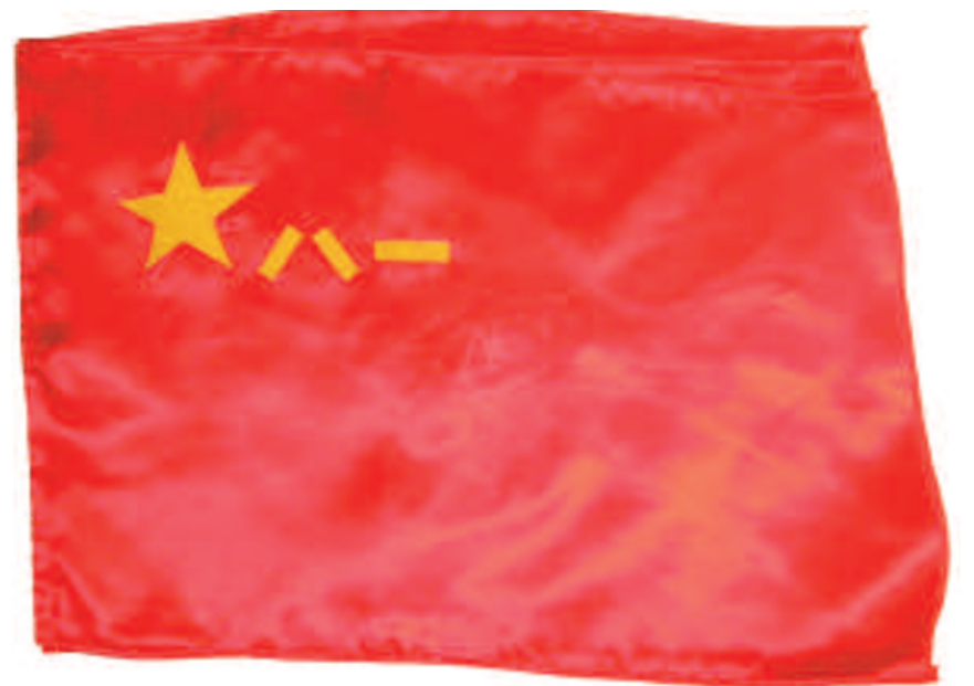
ZFC1326 China - People's Liberation Army Flag. The flag of the People's Liberation Army flag was adopted in 1949. It adds to the star representing the Communist Party of China the Chinese numerals "8" & "1" symbolizing its founding date of August 1, 1928. This flag dates from the 1980s.