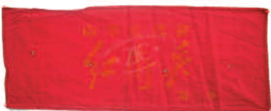
ZFC2022 A generic Red Guard meeting representative armband. Acquired in Beijing in the 1990s.