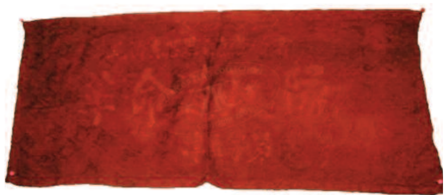
ZFC2024 The armband's inscription is partially obscured through use, discernible however are "Revolutionary Rebel Team", "Mao Zedong Thought..." and "Tianjin." Acquired in Beijing in the 1990s.