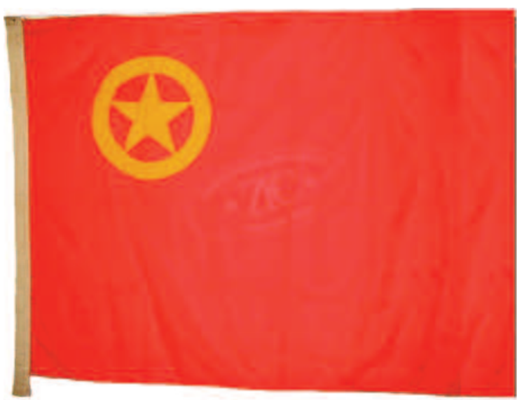
ZFC2015 Communist Youth League (CYL) Flag. This CYL flag dates from the 1950s when all of the Communist Party of China's (CPC) youth organizations were merged. Surrounding the star, which represents the CPC, is a ring symbolizing the youth of China unified around the CPC. Together the star and ring of the CYL stand for the unity of the youth of all of China's ethnicities. This flag dates from the 1980s.