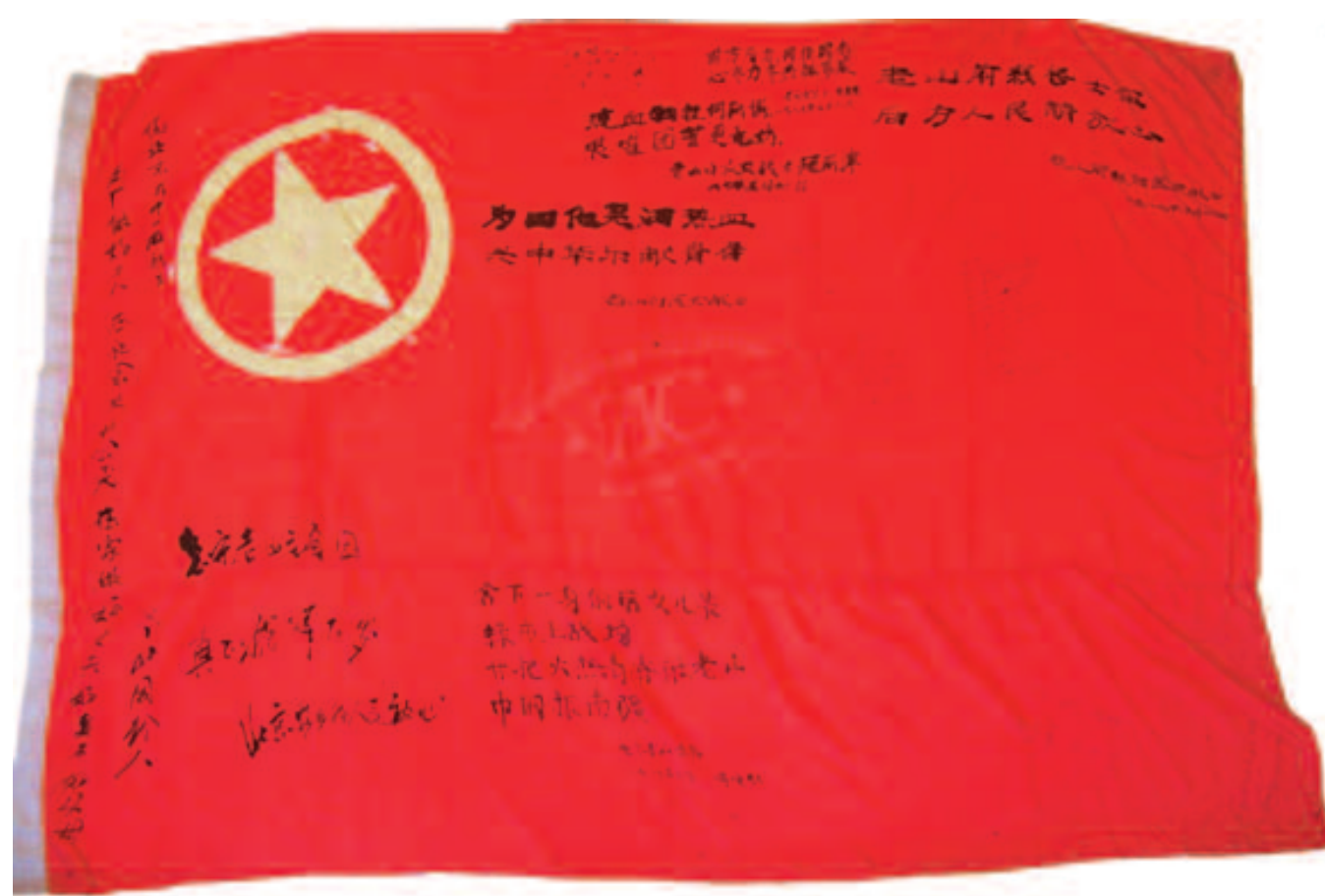
ZFC2475 Communist Youth League Flag of 1987. This memorial Communist Youth League (CYL) battle flag was inscribed by CYL combatants and medical personnel to visiting CYL well-wishers from Beijing during the Sino-Vietnamese conflict on 15 May 1987. This flag was acquired in 2007.