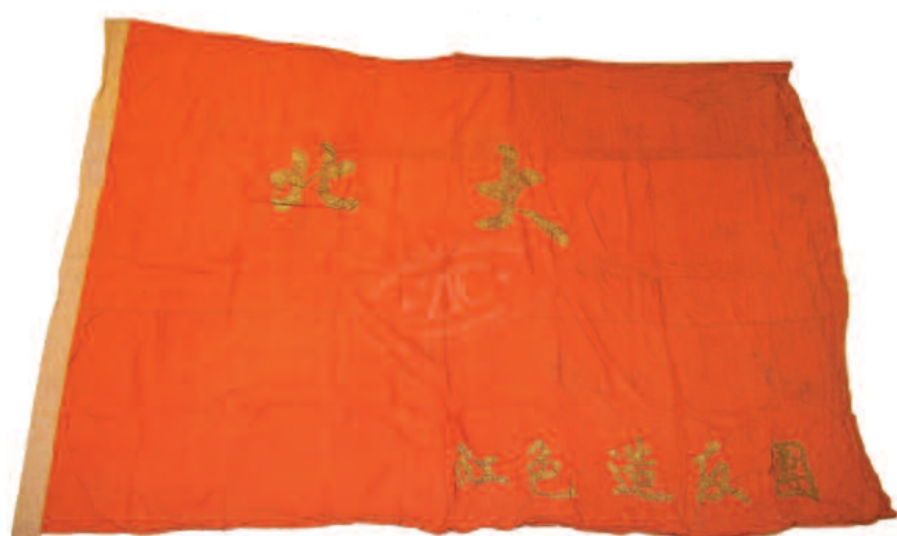
ZFC2482 China - Beida University Red Guards, Beijing. This flag was used by the Red Rebel Group at Beida University (Peking University) during the Cultural Revolution. This flag was acquired in Beijing in 2007.