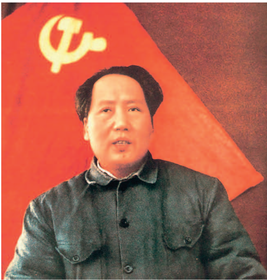
ZFC1266 Mao Zedong shown here in front of the Chinese Communist Party Flag sometime during the Long March of 1934 to 1935. The use of red flags has been ubiquitous in China since the 1949 Communist victory. It infiltrates is all aspects of national symbols.