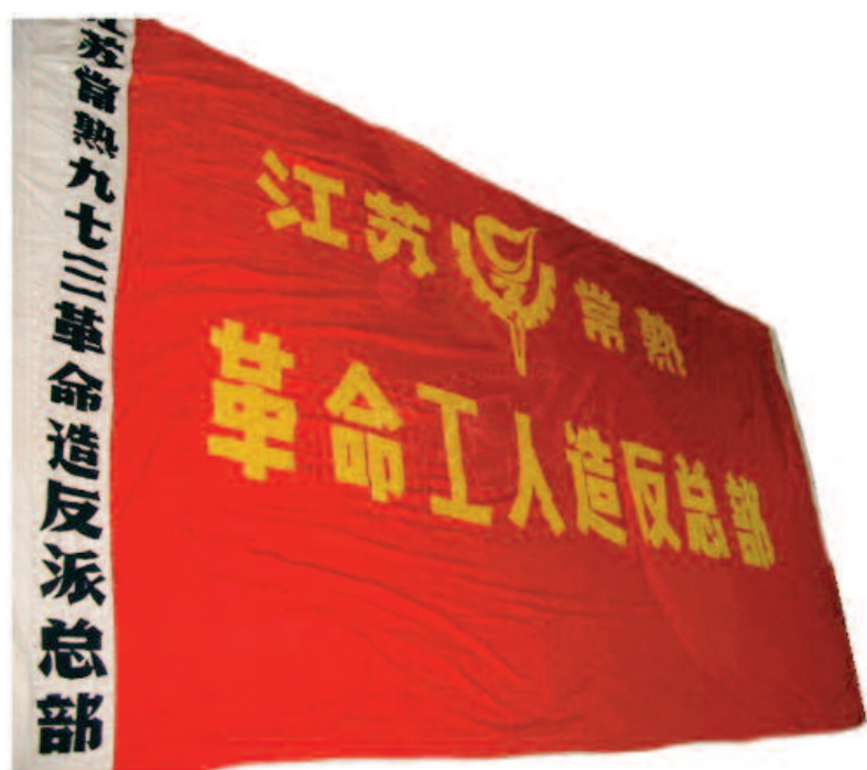
ZFC2166 China - Red Guard Changshu, Jiangsu HQ. This is the Cultural Revolution color of Faction 973 of the Revolutionary Rebel Headquarters, Changshu, Jiangsu. Acquired in 2004.