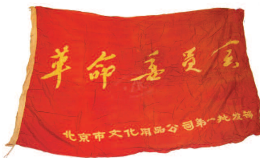
ZFC2481 China - Revolutionary Committee Flag, Beijing. This is the flag used by the Revolutionary Committee of the Number 1 Wholesale Department of the Cultural Products Company, Beijing. This flag was acquired in Beijing in 2007.

Armbands of the Chinese Cultural Revolution More commonplace than red flags were the red armbands. If every group had a red flag every member had a red armband