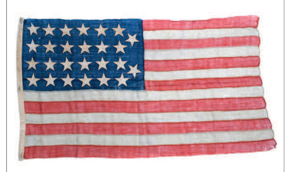
ZFC2386 26 Star U.S. Boat Flag. In the first half of the 19th century U.S. Navy Boat Flags generally bore the full compliment of stars as in this 26 star example. Experts speculate that due to the striking rows of stars and the size, this might be a U.S. Navy Boat Flag.