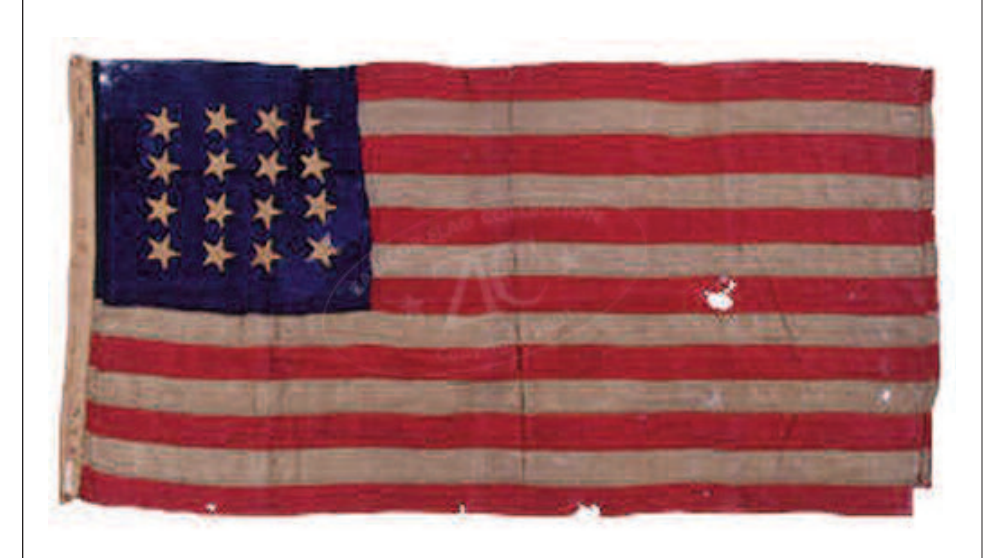
ZFC0029 16 Star U.S. 4-4-4-4 Navy Boat Flag - Navy Yard Charleston. This flag is marked with both its size and place of manufacture, "6 Ft. BOAT ENSIGN" and "N Y C," a prime example of a Navy Yard made flag. From the collections of the Star Spangled Banner Flag House and Museum, 1850s.