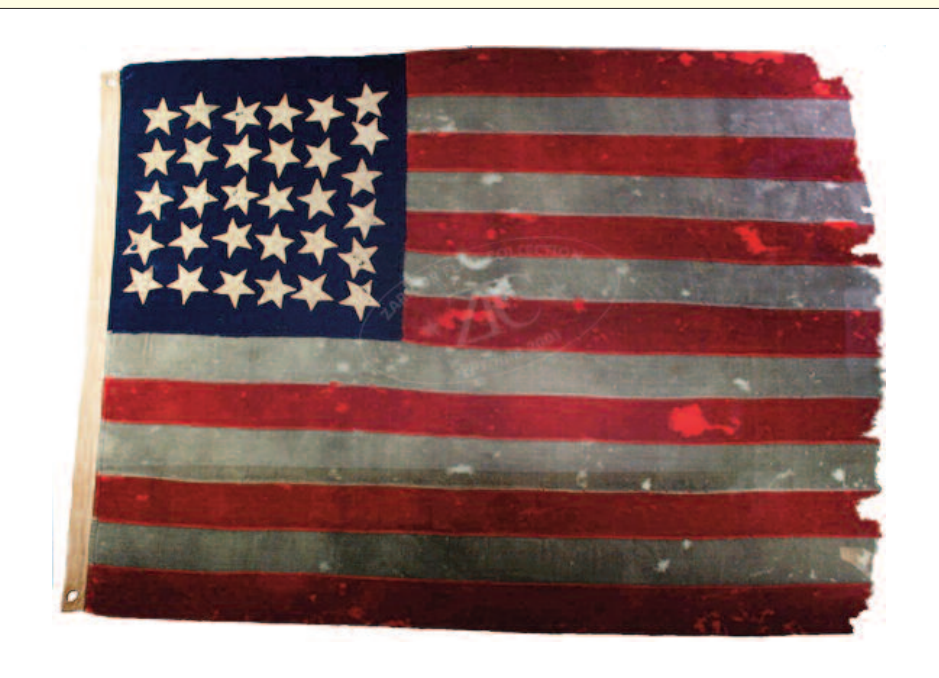
ZFC1453 31 star U.S. Boat Flag. This flag bears a striking resemblance to a 31 star Boat Flag, with a reversed canton that accompanied Commodore Oliver Hazard Parry to Japan in 1853. Posteriorly this flag would be displayed during the 1861 Pratt St, Riots in Baltimore.