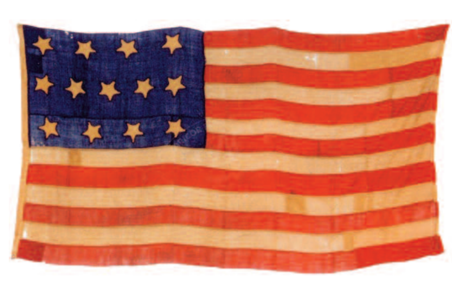
ZFC0707 13 Star U.S. Boat Flag from the revolutionary privateer Minerva, 1782. The 4-5-4 horizontal star pattern is the oldest pattern found on U.S. flags and would reappear in the decades between the 1850s and the 1870s.