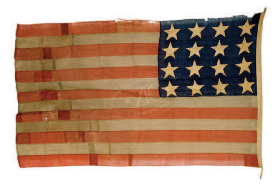
ZFC2385 16 Star U.S. 4-4-4-4 Boat Flag - Johnson Bros. Bath Maine. This flag is marked "(U.S.) Ensign from Johnson Bros: Bath, Maine" a firm that has it origins in the 1840s. The size suggests that this is a civilian Boat Flag, mimicking ZFC0029, 1850s.