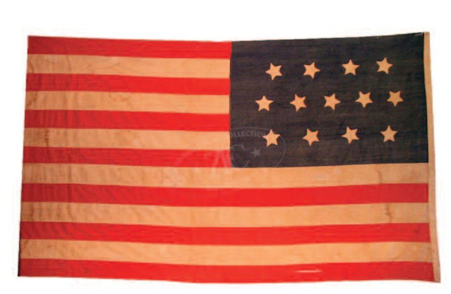
ZFC0359 13 Star 4-5-4 hand sewn cotton civilian Boat Flag. This flag is very similar in size to U.S. Navy Size Number 10, but likely a civilian copy, 1850s to 1860s.