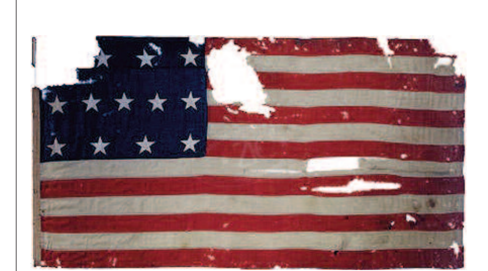
ZFC2507 13 star U.S. 4-5-4, #12 Navy Boat Flag used at the amphibious landings at Ft. Fisher, North Carolina, Jan 1865 This flag was used on one of the small boats of Rear Admiral David Dixon Porter's fleet when it attempted to capture Fort Fischer, a powerful bastion protecting the Confederacy's last open port, located in Wilmington, NC.