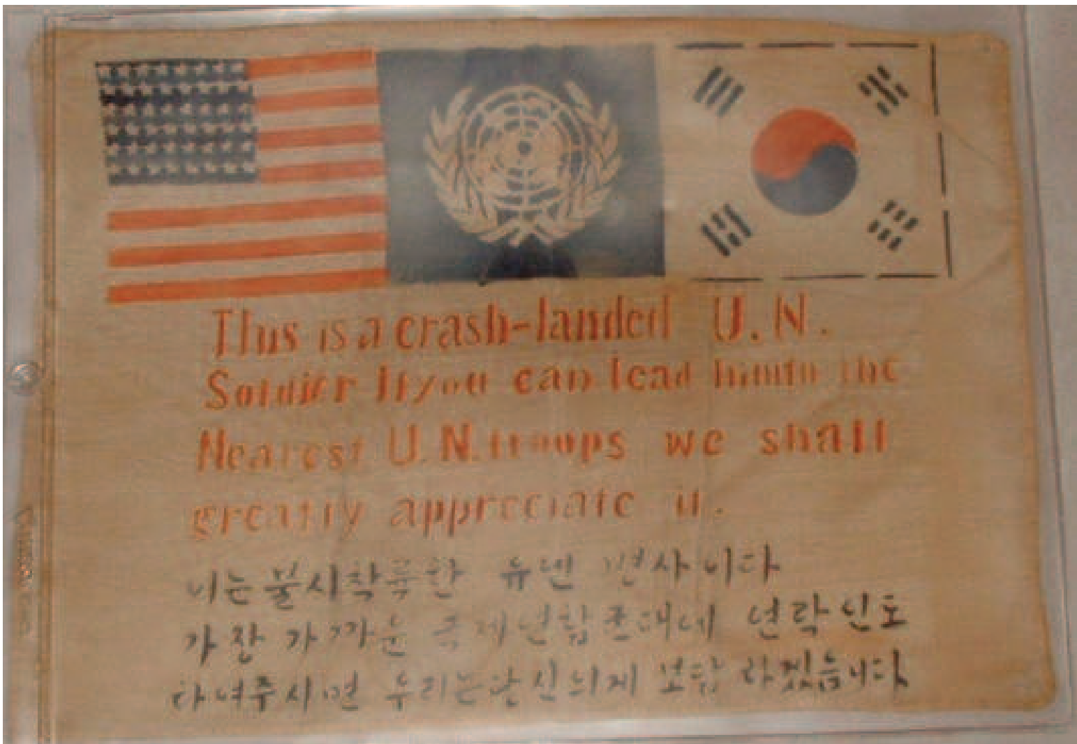
ZFC3057 A theatre made "Blood Chit" made during the United Nations led efforts to thwart the North Korea's invasion of South Korea. It is printed in two languages and bears the flags of the United States, the United Nations and South Korea, 1951 to 1953.