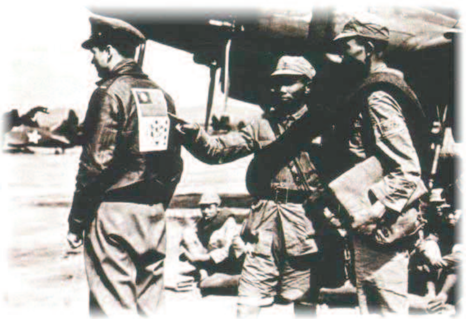
Chinese soldiers inspect an American Airman's Rescue Identification Patch or "Blood Chit" during World War II.