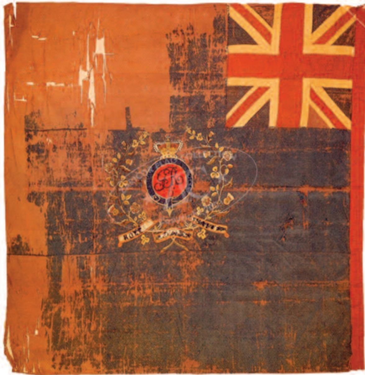
ZFC0451 United Kingdom 5th Royal Veteran's Reserve Regiment, Napoleonic Wars, 1802-1819. This post 1801 British Infantry Color can be distinguished from its predecessors by the diagonal, so-called St. Patrick's red counter-changed cross in the canton. Used between 1802 and 1819, carried by the 5th Royal Veteran Battalion.