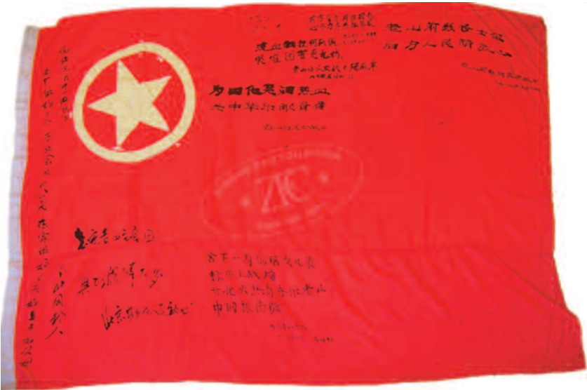
ZFC2475 China -Communist Youth League Flag from the Sino-Vietnamese Conflict, 1987. This is a presentation flag of the Communist Youth League of China (CYL). This flag is a silent witness to the history of a conflict almost unknown in the west.