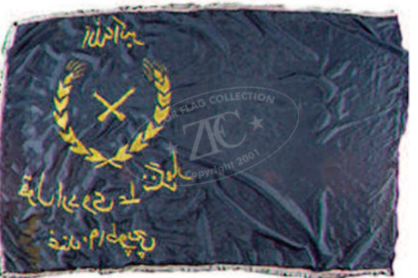
ZFC0504 Taliban Artillery Regimental H.Q. Color, taken Nov. 2001, Jalalabad, Afghanistan. This Taliban flag was recovered from the rubble of what is believed to be the regimental commander's office of the headquarters of the Taliban Army in Jalabad, Afghanistan. It was recovered in November 2001 by independent filmmaker Jim Burroughs.