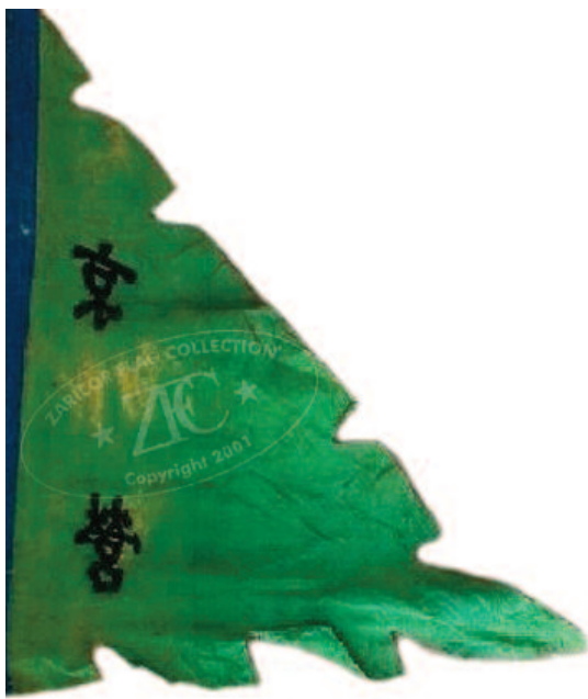
ZFC3179 Chinese Imperial Army, Forbidden City Designating Flag - Boxer Rebellion, 1900, Capture by 14th US Infantry. This pennant was previously represented as a flag associated with the Society of Righteous and Harmonious Fists, or "Boxers." A preliminary translation of the ideograms has led to an alternative conclusion on the flag.