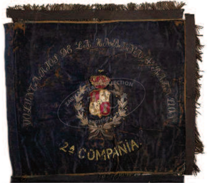
ZFC3122 Spanish Colony, Cuban 4th Btn, 2nd Co, Havana Volunteers, Cuban Militia Color, Spanish American War, 1898. The Cuban Volunteers were troops raised in Cuba after the first war for Cuban independence in 1868. Used against the rebels, they were drawn from Cuba's lower classes and were accused of harsh tactics.