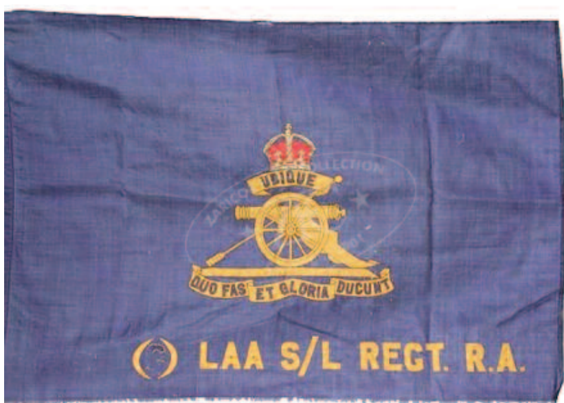
ZFC3266 United Kingdom. Royal Artillery, Camp Flag, WWII, 1944-1947. A Royal Artillery camp flag of Battery C of the Light Anti-Aircraft Searchlight Regiment of the Royal Artillery. Although batteries of the Royal Artillery do not carry flags - the gun is considered the symbol of the unit - their camps were often marked with flags like this example.