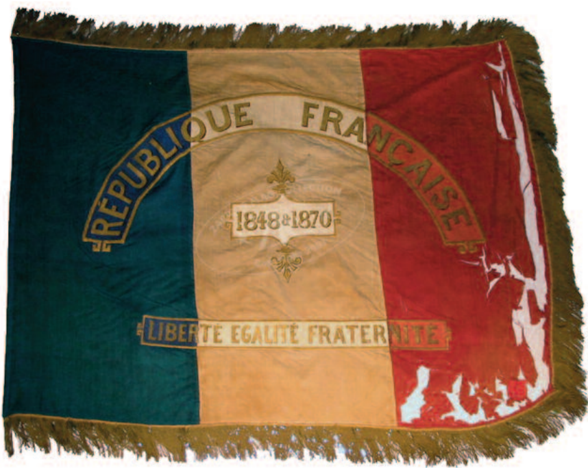
ZFC0417 France - National Guard Color 15th Battalion, 1870. Its inscriptions and distinctive finial can identify this flag, from the De Young Museum. Following the defeat of the French Army in the 1870 war with Prussia and the creation of the radical Commune in Paris, the regular Army was replaced by a National Guard.