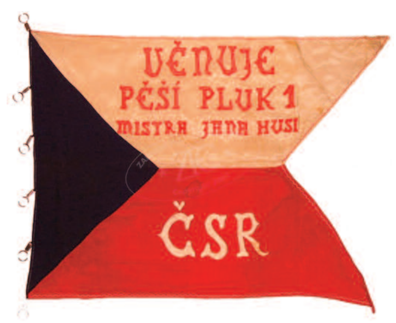
ZFC1425 Czechoslovakia Calvary Presentation Guidon - "Jana Husi," 1920 - 1939. This is a silk presentation guidon from the Czechoslovakian Army of the so-called First Czech Republic. The guidon is inscribed in red on the upper white stripe with the words, "Venuje pěší pluk Mistra Jana Husi." On the lower red stripe, "CSR" is inscribed in white.