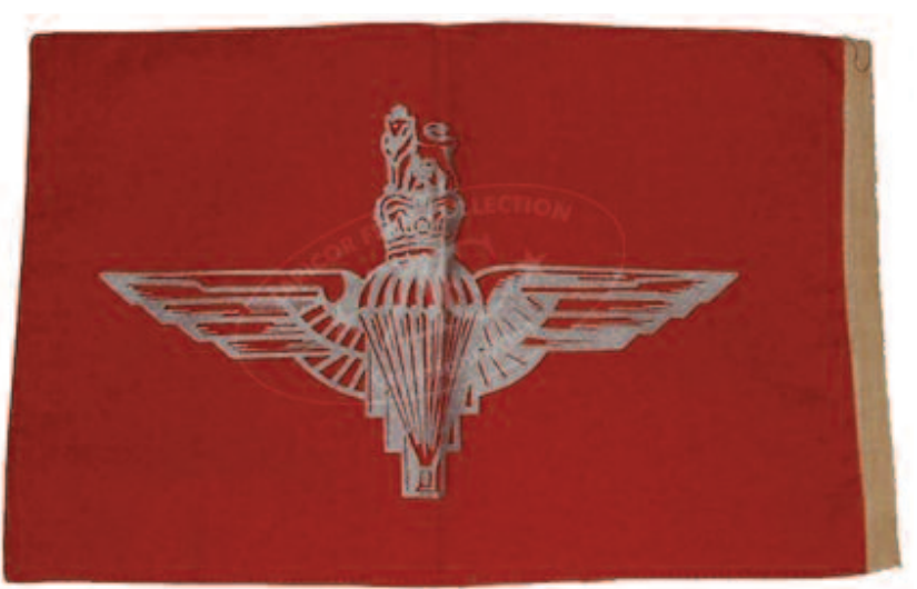
ZFC3058 United Kingdom, Parachute Regiment, Camp Flag, Falklands War, 1982. This is a Parachute Regiment Camp Flag from the war in Falkland (Malvinas) Islands between the UK and Argentina in 1982.