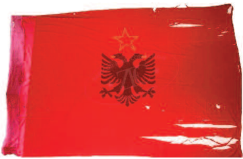
ZFC1123 Albania, Partisan (Communist) National Liberation Front, Militia Flag, WWII, 1944. In 1945, at the end of World War II, an American soldier traded two cartons of Lucky Strike cigarettes for this flag. This flag is made partially of damask material that once adorned the windows of a wealthy family in Eastern Europe.