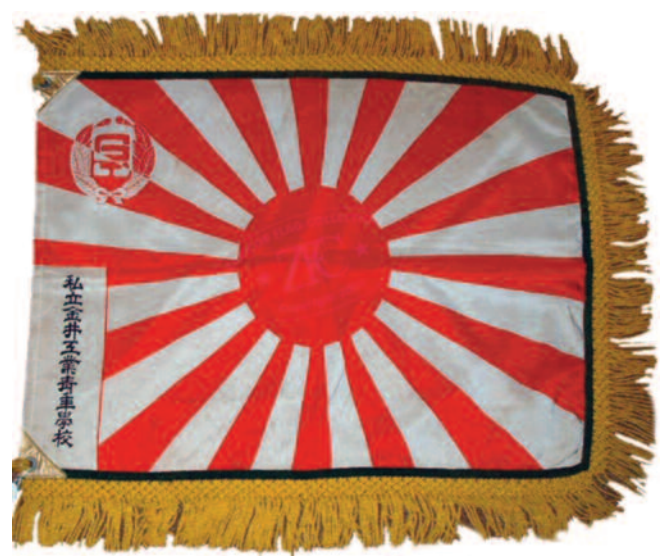
ZFC2569 Imperial Japan, Military Aviation School, Unit Color, WWII, 1945. This Japanese organizational color conforms to the general style of Imperial Japanese regimental flags. Japanese army colors bore purple fringe, so the significance of the golden yellow fringe and the insignia on this flag remain unknown.