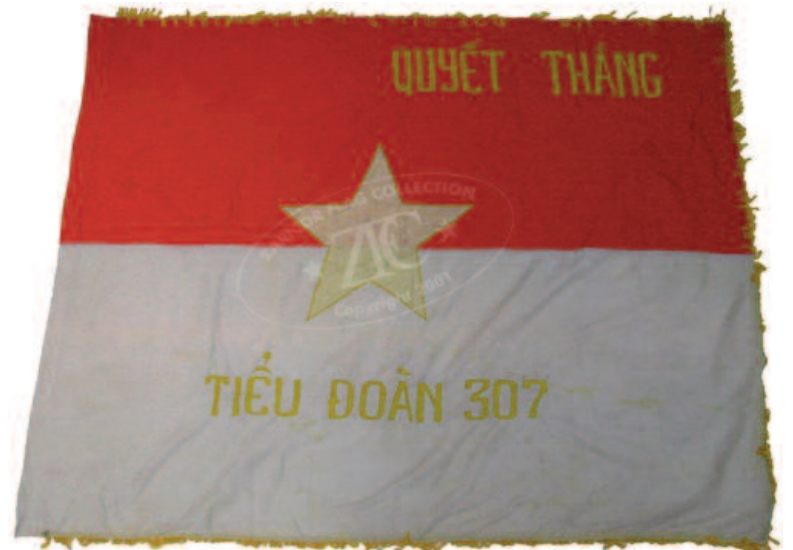
ZFC3399 Viet Cong 307th Battalion of the 273rd Regiment, Vietnam War, 1966. This fringed cotton Vietcong Battalion color is embroidered with the unit number "307" and the Vietnamese slogan "Quyết Thắng" or "Resolved to Win." The flag is a war trophy taken in combat from the Viet Cong.