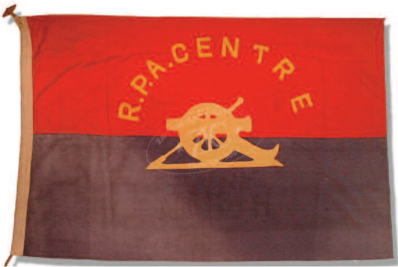
ZFC1242 Pakistan Royal Artillery Center Flag - Post Partition of India, 1947. This Royal Pakistani Artillery Centre flag was the fourth flag in the Zaricor Flag Collection. The method of construction of this flag is consistent with the haste with which the Artillery branch of the newly formed Pakistani Army was created.