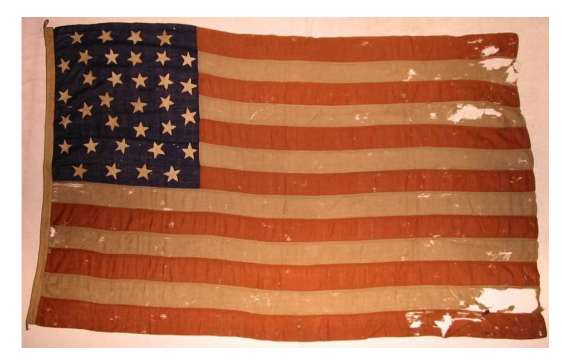
ZFC0211-U.S. 34 Star National Color St. Louis Home Guard, 1861 to 1863.