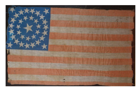
ZFC0588—U.S. 35-Star printed parade flag with double ring star pattern with center star and corner accent stars. Flown in Boston to celebrate the end of the Civil War and to