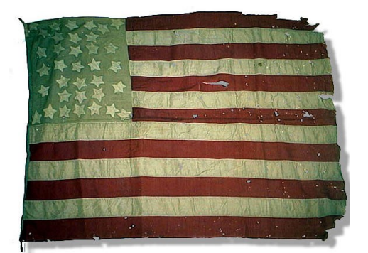
ZFC0021—U.S. 34 Star Flag with an irregular rectilinear star pattern from the route of the 1861 Pratt St. Riots,