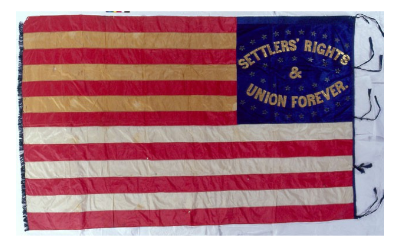
ZFC0001—Reverse of Canton for ZFC0001 which clearly demonstrates the aspirations of the "Settler Army: in California—Loyalty and Property Rights.