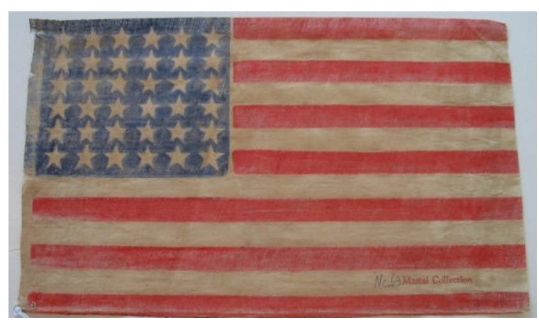
ZFC0693—36 Star U.S. parade flag, with a 6 X 6 rectilinear star pattern , 1865 to 1867; all stars have one point upwards; former Mastai Collection flag.