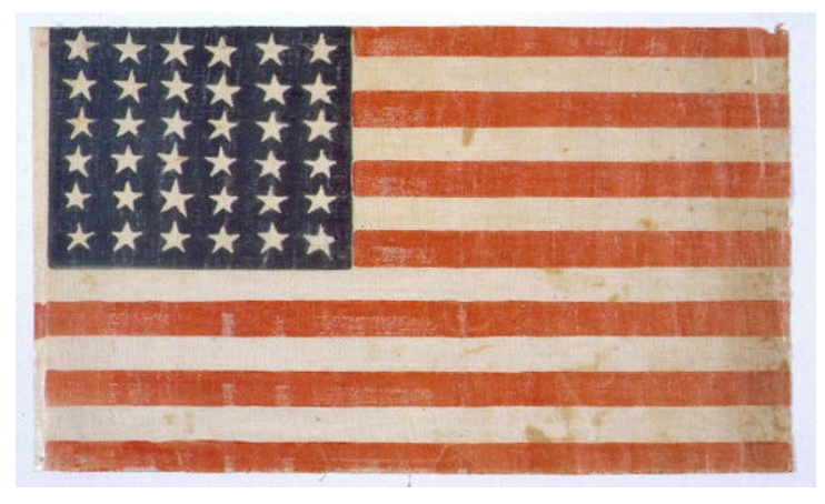
ZFC0254—36 Star U.S. parade flag, with a 6 X 6 rectilinear star pattern , 1865 to 1867; all stars have one point upwards.