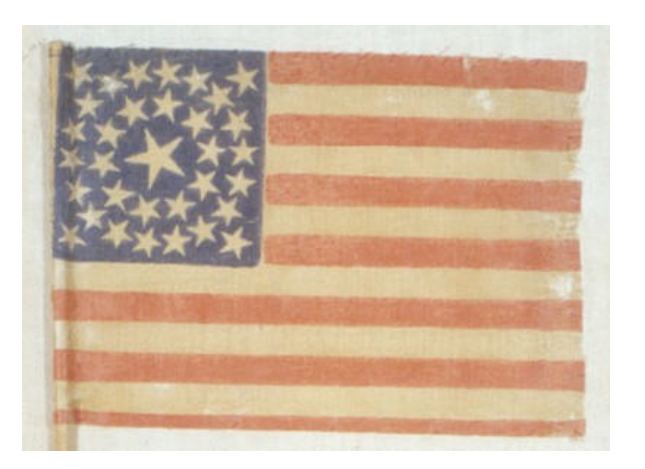
ZFC0586—33 Star U.S. double ring star pattern printed parade flag, 1858 to 1861.

ZFC2210— 33 Star U.S. double ring star pattern flag with only 10 stripes, a home made cotton flag, 1858 to 1861.