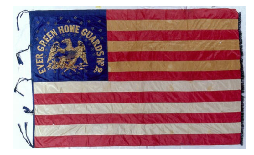
ZFC0001—US "Eagle Canton" 33 Star scatter pattern California Militia National Color of the Evergreen Home Guard No. 2, 1861.