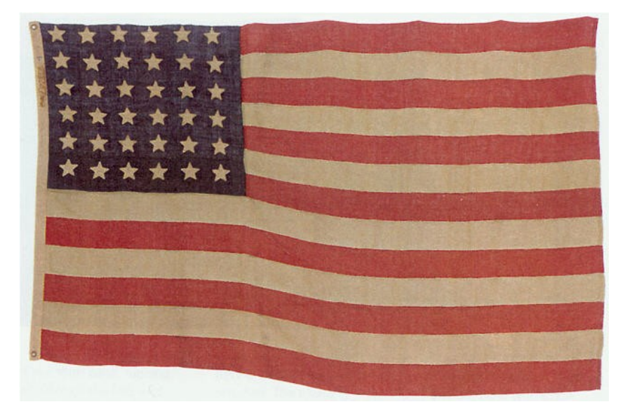
ZFC0618—36 Star U.S. Flag, with a 6 x 6 rectilinear star pattern , 1865 to 1867; re-used at opening of Brooklyn Bridge on 24 May 1883.