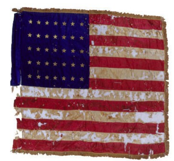
ZFC0460—U.S. 35 Star National Color, with a 7-7-7-7 rectilinear star pattern from the New York Depot, 1863 to 1865.