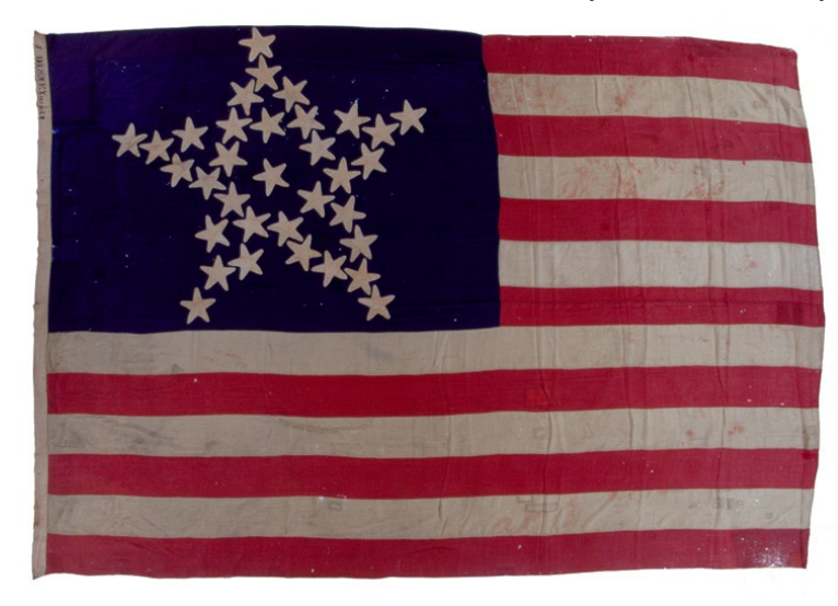
ZFC1241—U.S. 34 Star "Grand Luminary" flag, 1861 to 1863; half-staffed at the Albsany depot of the New York Central Railroad for President Abraham Lincoln's Funeral, April 1865.