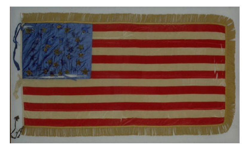
ZFC0280—36-Star U.S. Infantry flank marker, with a double ring star pattern, 1865—1867; likely form the Grand Army Review 24 & 25 May 1865.