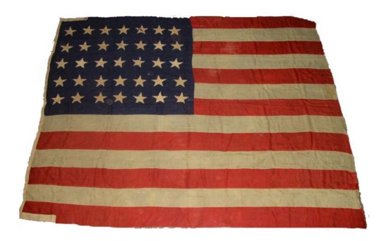
ZFC0648—U.S. 35 star flag with 7-7-7-7 rectilinear star pattern, 1863 to 1865.