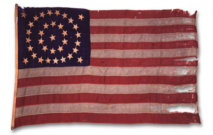
ZFC0023—35-Star United States Flag with double ring star pattern with center star and corner accent stars. Attributed to Jabez W. Loane flag maker of Baltimore., Maryland, 1863 to 1865. From the collection of the Star Spangled Banner Flag House and Museum, Baltimore,