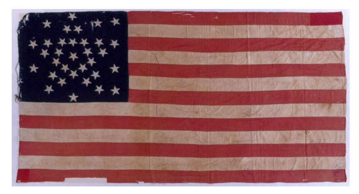
ZFC1155—33 Star U.S. "Grand Luminary" Flag, made with additional accent stars all original to initial construction, not a conversion, 1859 to1861.