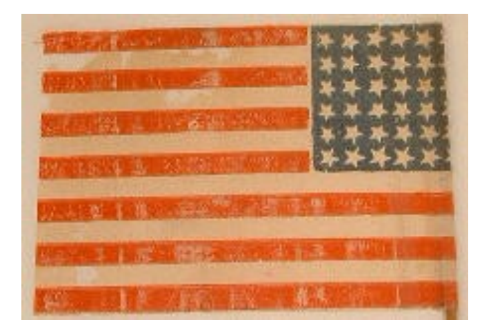
ZFC0747—36 Star U.S. parade flag, with a 6 X 6 rectilinear star pattern, 1865 to 1867; all stars have one point oriented towards the hoist.