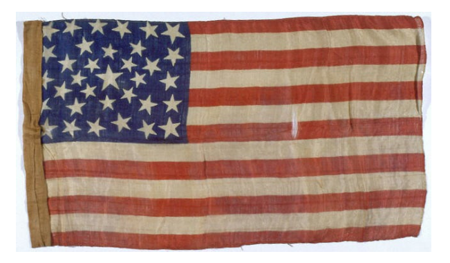
ZFC0015-34 U.S. parade flag scatter pattern starfield with large center star, from the Peale Museum, 1861 to 1863.