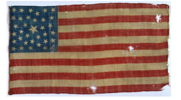
ZFC0016—U.S. 35 star printed parade flag with scatter pattern around a large center star, 1863 to 1865.