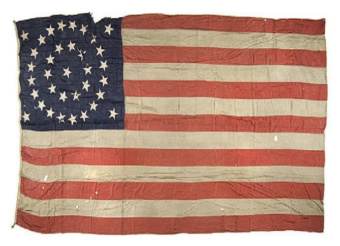
ZFC3086—35-Star United States Flag with double ring star pattern with center star and corner accent stars. Attributed to Jabez W. Loane, flag maker of Baltimore., Maryland, 1863 to 1865.