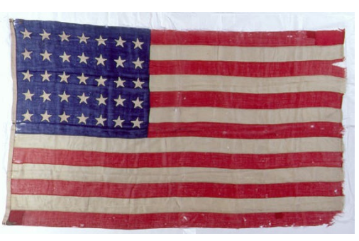
ZFC1396—U.S. 35 star flag with 7-7-7-7 rectilinear star pattern, 1863 to 1865. Marked Ingersoll.