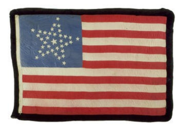
ZFC0617— 36 Star U.S. "Grand Luminary" Mourning Flag flown during the period of national mourning during the funeral of President Abraham Lincoln, 1865. Used again to mourn President John F. Kennedy, 1963.