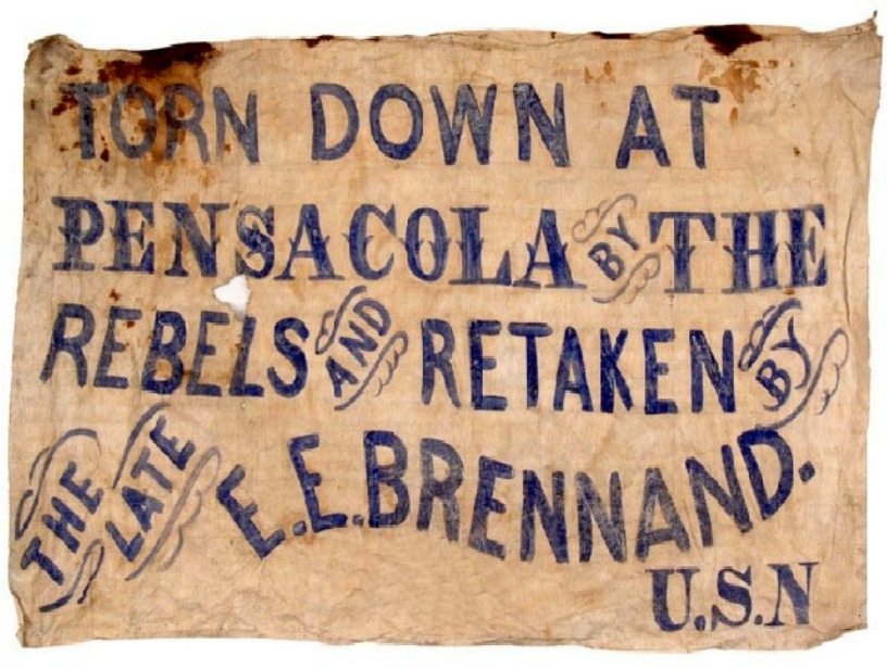
Banner attachment to ZFC2510, recounting the capture and recapture of this flag. Displayed upon the occasion of the reelection of President Abraham Lincoln, November 1964, Pittsburgh, PA.