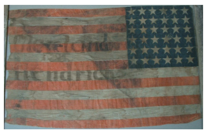
ZFC3215—36 Star U.S. parade flag, with a 6 X 6 rectilinear star pattern, 1865 to 1867; Civil War surplus put to us as a campaign flag in 1884 for the Cleveland and Hendricks campaign.

ZFC2495—36 Star U.S. parade flag, with a 6 X 6 rectilinear star pattern & 11 stripes, 1865 to 1867.,; Civil War surplus overprinted printed in 1868 for the Grant and Colfax campaign.