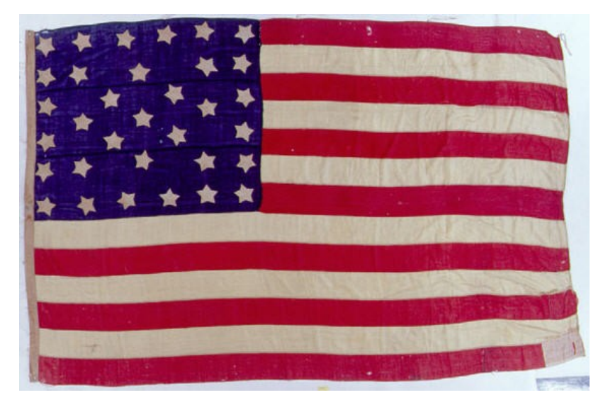
ZFC1403— 33 Star United States diamond in a box pattern Flag, 1858—1861; likely maritime ensign.